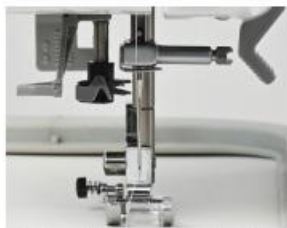
Automatic Threading Device